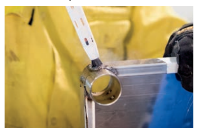
Better control of bristle shape